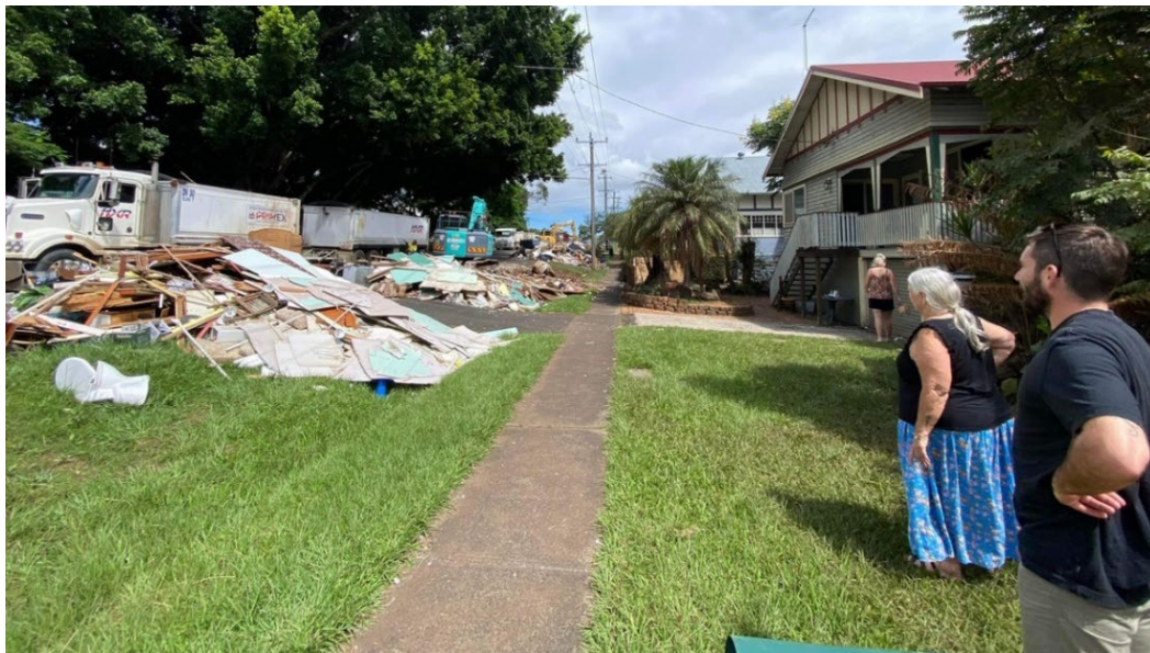
Figure 10 Stripped house interiors and other debris on nature strip during clean-up after the floods

Submission 29, Danielle Pickford and Sarah Moran, p 14