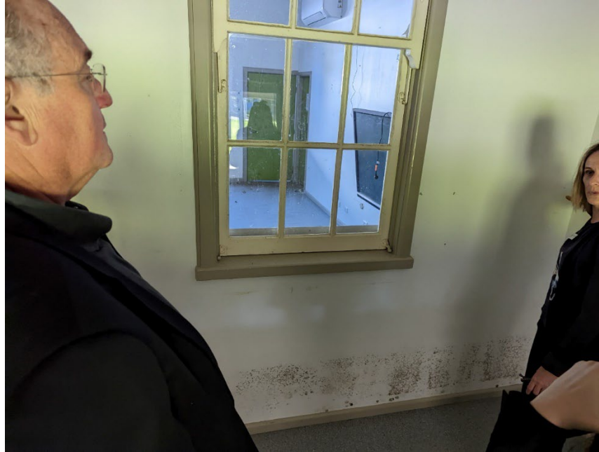
Figure 11 Committee members inspecting mould in affected classrooms at Condong Public School