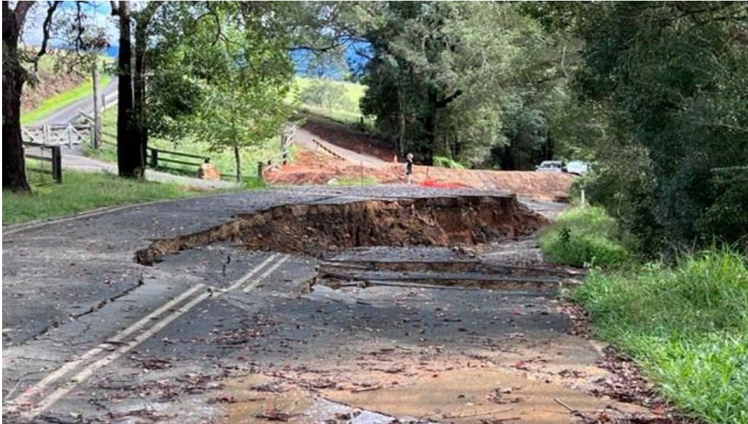
Submission 61, Tyalgum District Community Association, p 14.