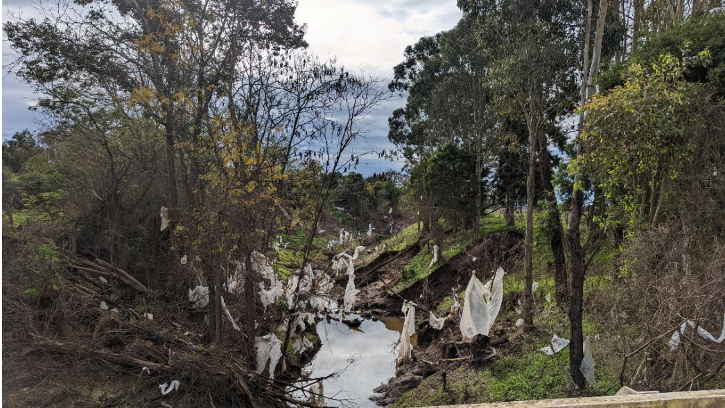
taken during site visit to Pitt Town Bottoms, 3 June 2022