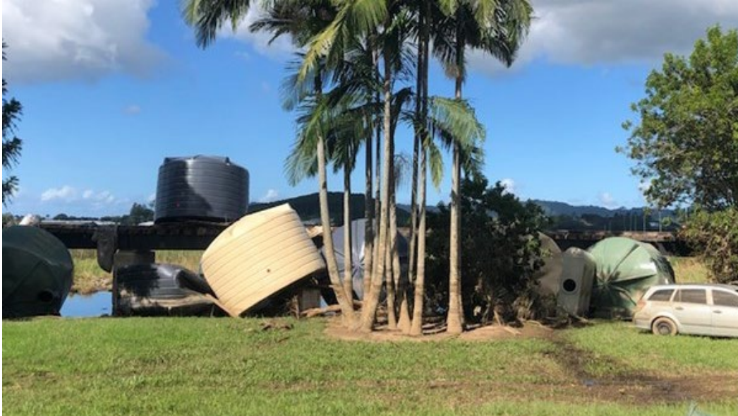
Figure 4 Flood debris including rainwater tanks washed up onto rail bridge, Tweed Shire