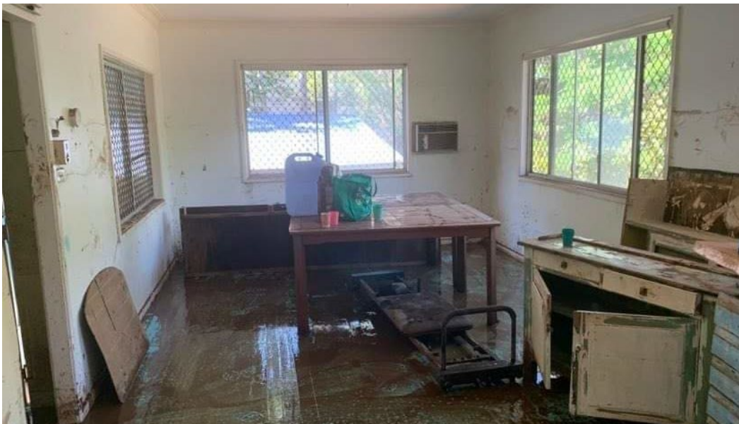
Figure 5 A dining room damaged by flood water in Lismore

Submission 62, Mrs Veronica Coughlan, p 6.