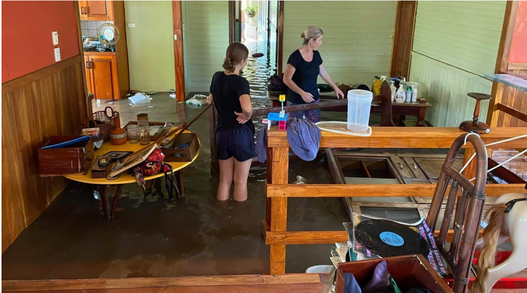
Figure 9 People inspecting inundation of floodwater inside a dwelling

Submission 29, Danielle Pickford and Sarah Moran, p 15