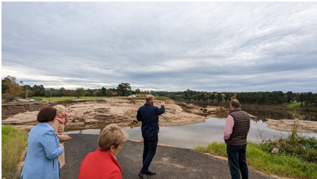
Figure 1 Committee members inspecting the scale of erosion at Cornwallis

taken during site visit to Cornwallis, 3 June 2022