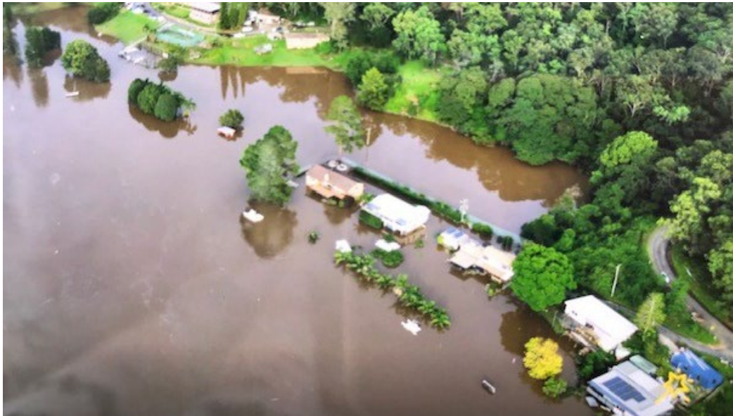
Figure 1 Aerial view of flood affected properties on the Hawkesbury River

Correspondence, Ms Rochelle Miller, Private individual, to the secretariat, 2 June 2022.